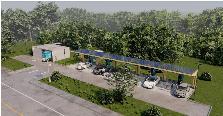
Mer und NIO – A partnership to help shape the future of sustainable mobility

----- The attached images are free for editorial use. A printable resolution of the images is available on request.